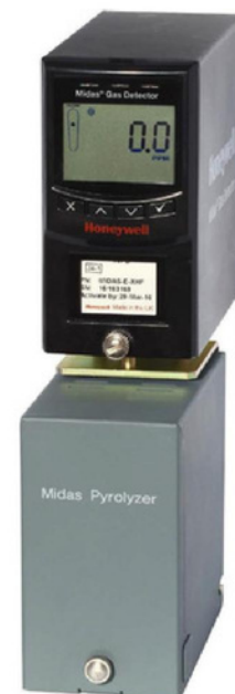
Midas Gas Detector with Midas Pyrolyzer

Offered as an option, the Midas Pyrolyzer allows for the detection of NF 3 and other Cx n F y gases. Cost of ownership is low, as the Pyrolyzer has a replaceable heater assembly with a lifespan of greater than two years. Even more, thanks to our new proprietary catalyst to improve efficiency in gas conversion, the Pyrolyzer delivers automatic flow control, temperature control, and fast and accurate performance. Additionally, the Pyrolyzer can run from a Midas Gas Detector that's powered by either PoE or 24 VDC.