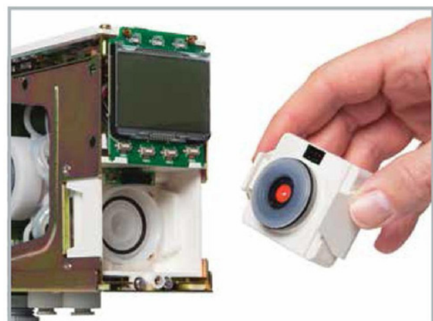
Midas Gas Detector plug-and-play sensor cartridge allows quick and easy sensor replacement